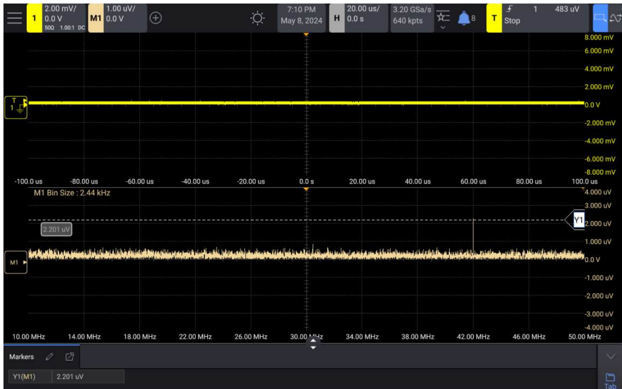
Figure 1. The oscilloscope captures a 2 \mu\text{V} , -100dBm signal very clearly in our FFT. This same signal would not be viewable with a higher noise floor oscilloscope.

You can achieve even greater accuracy (5x better) with up to 16 bits of resolution using the built-in bandwidth filters. Need to use the full bandwidth to 1 GHz? You will still get extremely high accuracy at the full bandwidth, with the ability to zoom to 500 \mu\text{V}/\text{div} .